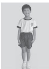
PE attire for boys / girls