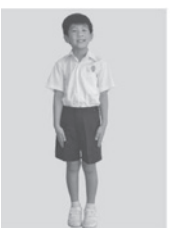
Uniform for boys