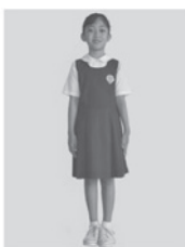
Uniform for girls