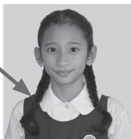
Long hair to be simply and neatly tied.