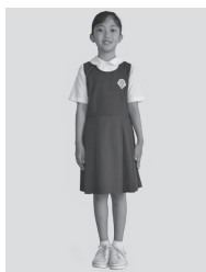
Uniform for girls