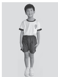
PE attire for boys / girls